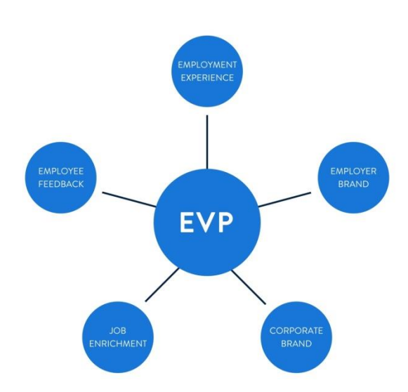
Fig.3. Components of EVP

On the basis of survey, an efficient and unique EVP can be developed that highlights the key ingredients of company's employer brand, differentiates it from competitors, that resonates with the needs, and desires of target audience and that can be reinforced throughout the recruitment channels.