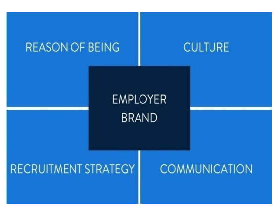
Fig.1. Pillars of an Employer Brand